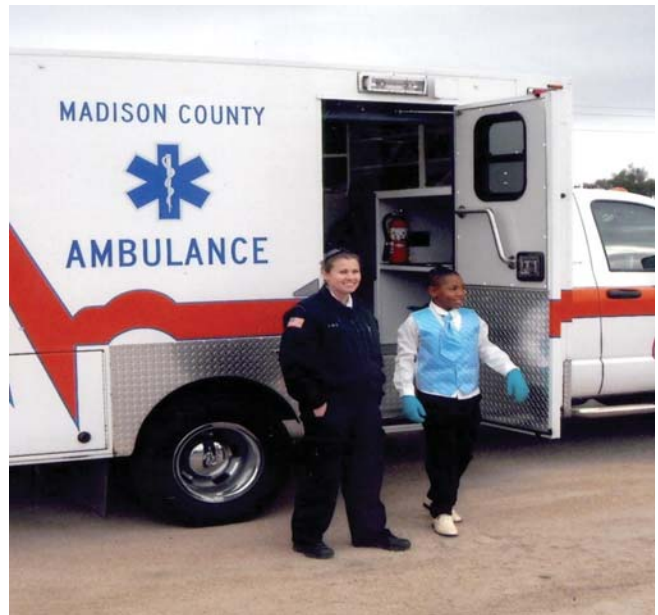
Madison County Ambulance service rep poses with MCMS student.